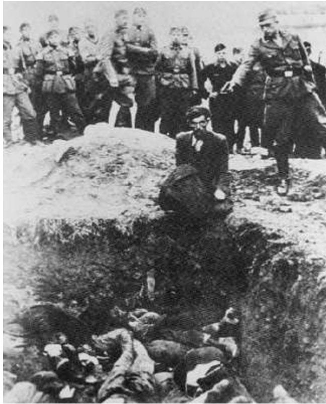
"NOT on Our Watch!"

every fascist and communist dictatorship in the 20th Century. Whenever a government makes war on its own people, it treats them like an occupied enemy population and uses the internment of women and children to break the will of the men fighting for their liberty – as was done to the Boars, to the Jewish resisters in the Warsaw Ghetto, to the Cossacks, and to the Chechens, for example. Such a vile order to forcibly intern Americans without charges or trial would be an act of war against the American people, and thus an act of treason, regardless of the pretext used. We will not commit treason, nor will we facilitate or support it.